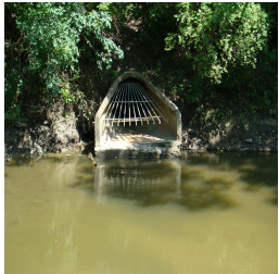
Storm water is captured from streets and discharged to local streams and rivers.

Storm water runoff in the form of rainfall or snow-melt flows from saturated permeable surfaces like roofs and paved driveways, sidewalks, parking lots and streets. It can create drainage and flooding problems and picks up pollutants such as oils, grease, fertilizers, pesticides, litter and metal. This