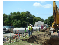
Storm sewer improvements.

Owners of all developed land in the City pay the storm water utility fees. This includes residential properties, commercial properties, industrial properties, churches, schools, County owned properties, and other non-profit organizations. Undeveloped land is not charged storm water utility fees because it does not have impervious surfaces.